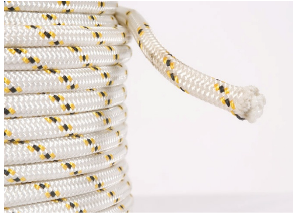
Spectra Rope available from 2mm (2.45kN) to 14mm (65.7kN)