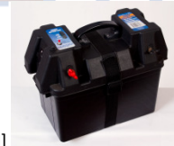
[Battery Box – battery not included]

Stand below tow ball for display only – not for sale